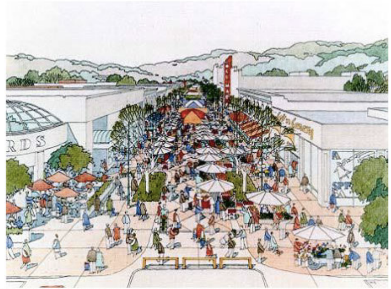
... <del>will be transformed once a week irto a Farmers Market,</del> can be transformed for special occasions and events