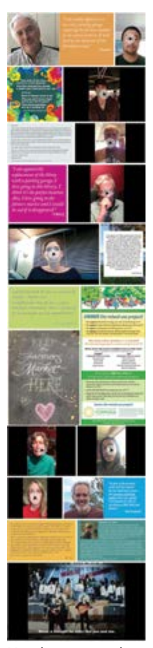
Many have expressed their wish to keep the Farmers' Market on Lot 4

a public space in the bargain. The far more environmentally responsible course is to leave the Downtown Library and the Farmers' Market where they work already. The City needs to follow basic urban planning principles: observe how people are using spaces already and collaborate to support and build on those uses.