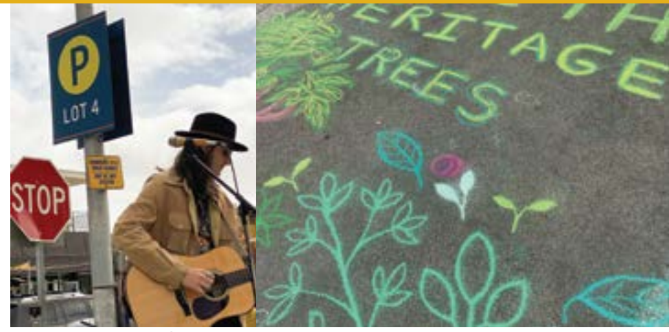
Artists came to Lot 4 for an Earth Day celebration. Could we have a commons and keep our beautiful trees next year?

Cedar Street with its 10 Heritage trees, is paved in asphalt and used for parking most of the time. Once a week, the lot blossoms into the Farmers' Market. But now, that community space is in jeopardy, the City is planning to build a 60- to 70-foot high "mixed-use" project entirely covering Lot 4.